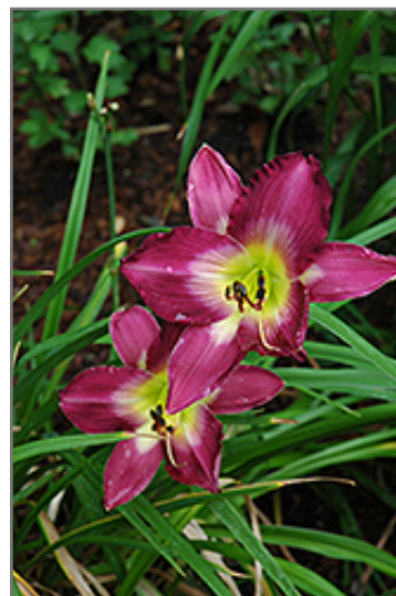
Swirling Waters Daylily flowers