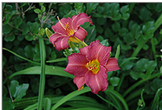
Little Wine Cup Daylily flowers