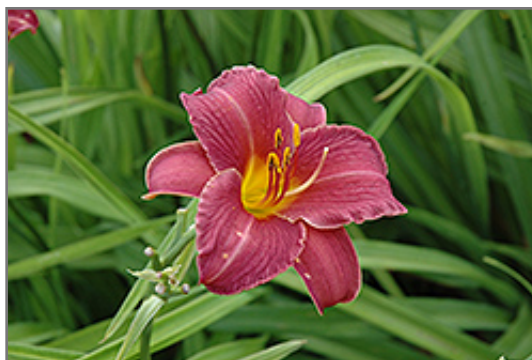
Little Wine Cup Daylily flowers