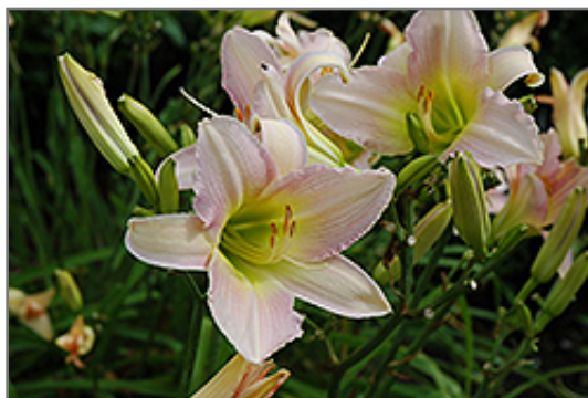
Catherine Woodbury Daylily flowers