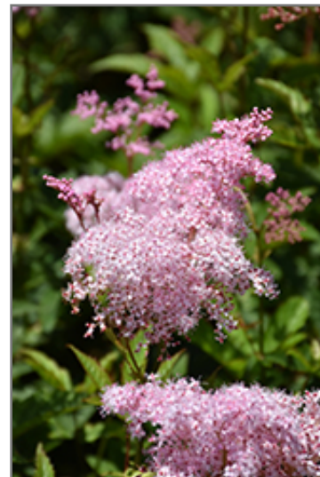
Queen Of The Prairie flowers