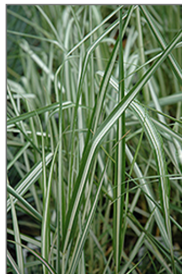
Avalanche Reed Grass foliage