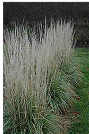
Avalanche Reed Grass in fall

Avalanche Reed Grass is recommended for the following landscape applications;