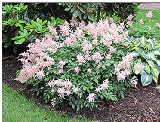
Peach Blossom Astilbe in bloom