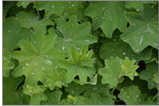
Lady's Mantle foliage

This plant performs well in both full sun and full shade. It is very adaptable to both dry and moist locations, and should do just fine under typical garden conditions. It is not particular as to soil type or pH. It is highly tolerant of urban pollution and will even thrive in inner city environments. This species is not originally from North America. It can be propagated by cuttings.