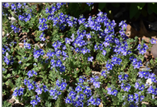
Tidal Pool Speedwell flowers

Tidal Pool Speedwell is recommended for the following landscape applications;