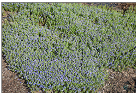
Tidal Pool Speedwell in bloom