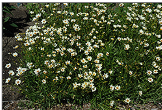
Star Cluster Tickseed in bloom