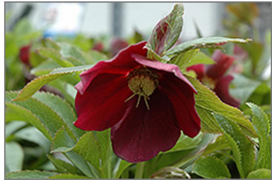
Red Racer Hellebore flowers