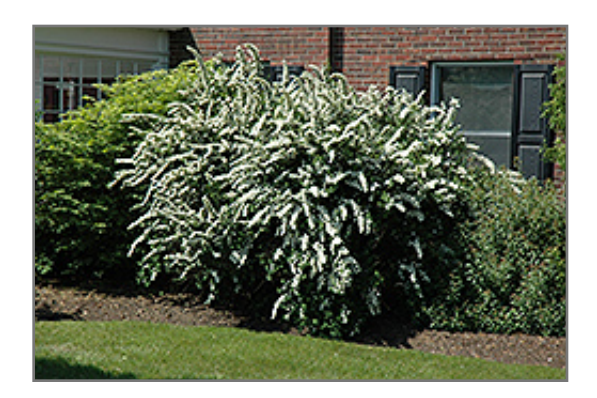
Renaissance Spirea in bloom

520 Highway 1 West Iowa City, Iowa 52246 (319) 337–8351 www.iowacitylandscaping.com