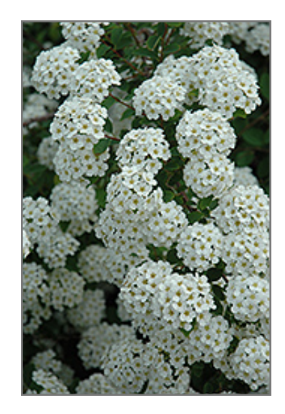
Renaissance Spirea flowers