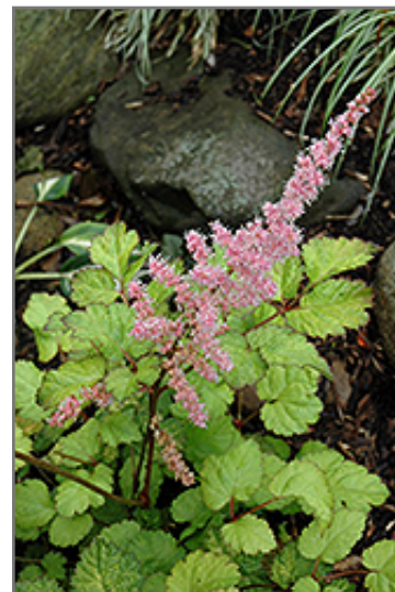
Amber Moon Chinese Astilbe flowers