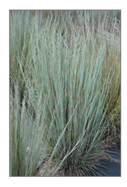
Prairie Blues Bluestem