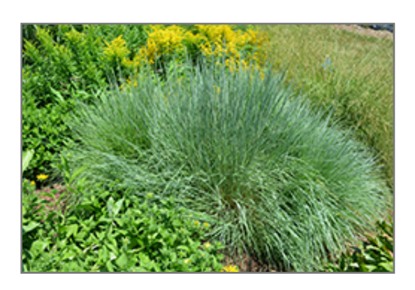
Prairie Blues Bluestem