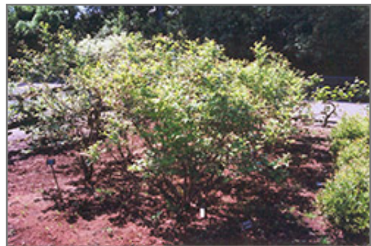
Northland Blueberry