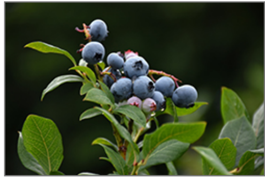
Northland Blueberry fruit