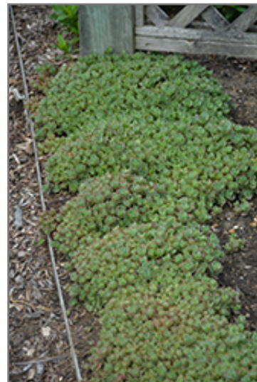
Lime Zinger Stonecrop

Lime Zinger Stonecrop is a fine choice for the garden, but it is also a good selection for planting in outdoor pots and containers. Because of its spreading habit of growth, it is ideally suited for use as a 'spiller' in the 'spiller-thriller-filler' container combination; plant it near the edges where it can spill gracefully over the pot. Note that when growing plants in outdoor containers and baskets, they may require more frequent waterings than they would in the yard or garden.