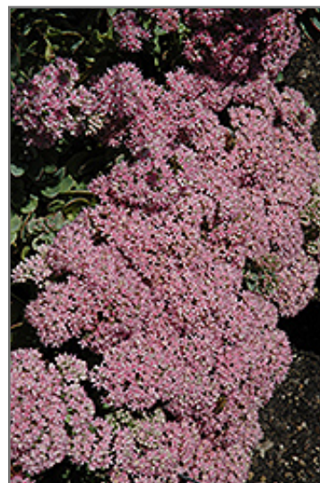
Lime Zinger Stonecrop flowers

This is a relatively low maintenance plant, and is best cleaned up in early spring before it resumes active growth for the season. It is a good choice for attracting bees and butterflies to your yard, but is not particularly attractive to deer who tend to leave it alone in favor of tastier treats. It has no significant negative characteristics.