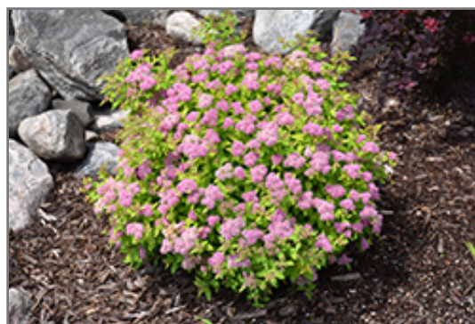
Dakota Goldcharm Spirea in bloom