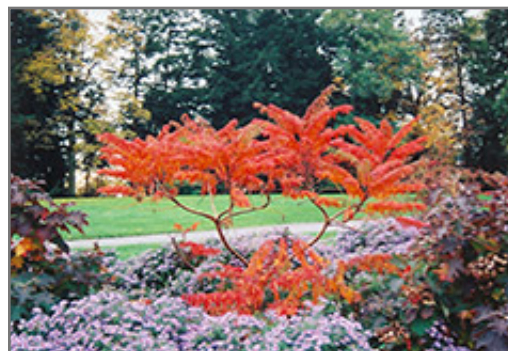
Cutleaf Staghorn Sumac in fall