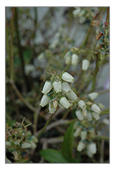
Chandler Blueberry flowers

This shrub is typically grown in a designated area of the yard because of its mature size and spread. It does best in full sun to partial shade. It does best in average to evenly moist conditions, but will not tolerate standing water. It is very fussy about its soil conditions and must have sandy, acidic soils to ensure success, and is subject to chlorosis (yellowing) of the foliage in alkaline soils. It is quite intolerant of urban pollution, therefore inner city or urban streetside plantings are best avoided, and will benefit from being planted in a relatively sheltered location. Consider applying a thick mulch around the root zone in winter to protect it in exposed locations or colder microclimates. This is a selection of a native North American species.