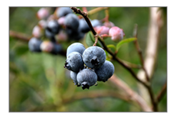
Chandler Blueberry fruit

Chandler Blueberry features dainty clusters of white bell-shaped flowers hanging below the branches in mid spring. It has bluish-green deciduous foliage. The oval leaves turn an outstanding red in the fall. It features an abundance of magnificent blue berries from mid to late summer. The smooth tan bark adds an interesting dimension to the landscape.