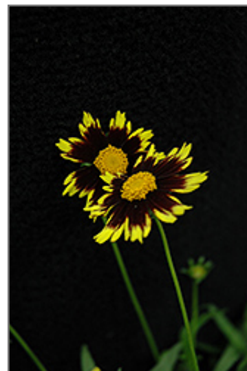
Cosmic Eye Tickseed flowers

Cosmic Eye Tickseed is recommended for the following landscape applications;