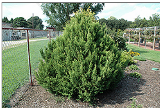
Cream Ball Falsecypress

Cream Ball Falsecypress is recommended for the following landscape applications;