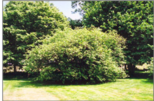
American Hazelnut

This plant is typically grown in a designated edibles garden. It performs well in both full sun and full shade. It is very adaptable to both dry and moist locations, and should do just fine under average home landscape conditions. It is considered to be drought-tolerant, and thus makes an ideal choice for xeriscaping or the moisture-conserving landscape. It is not particular as to soil type or pH. It is highly tolerant of urban pollution and will even thrive in inner city environments. This species is native to parts of North America.