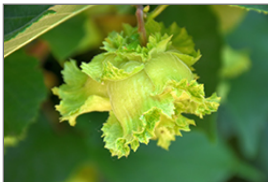
American Hazelnut fruit