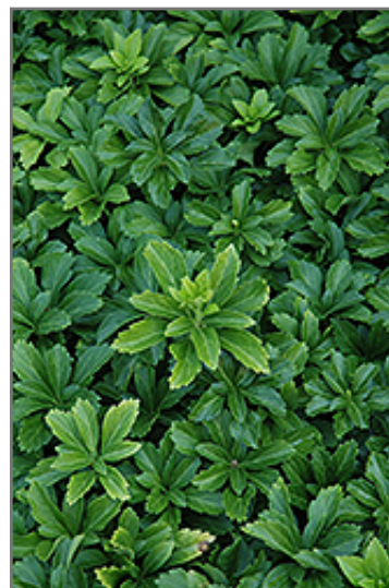
Green Sheen Japanese Spurge foliage