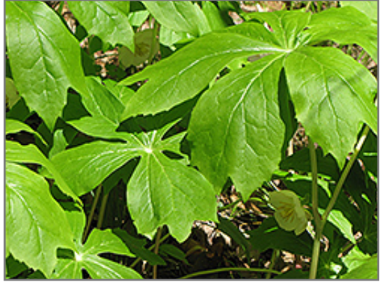
Mayapple foliage

This is a relatively low maintenance plant, and is best cleaned up in early spring before it resumes active growth for the season. It has no significant negative characteristics.