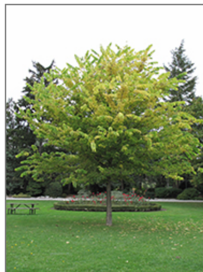
Common Hackberry in fall