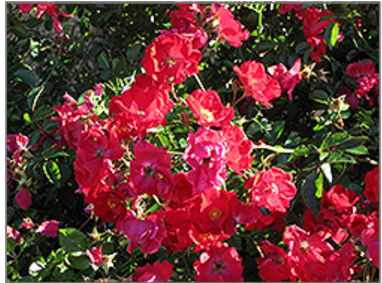
Flower Carpet Red Rose flowers

This shrub should only be grown in full sunlight. It does best in average to evenly moist conditions, but will not tolerate standing water. It is not particular as to soil type or pH. It is somewhat tolerant of urban pollution. This particular variety is an interspecific hybrid.