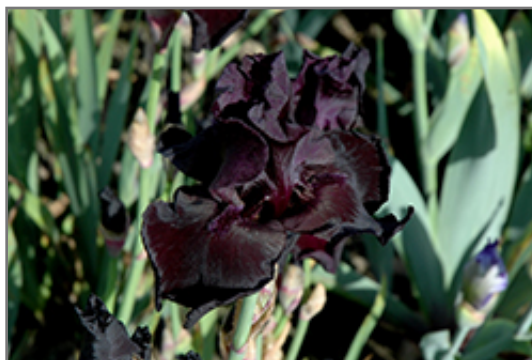
Before The Storm Iris flowers