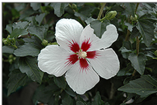
Lil' Kim Rose of Sharon flowers

Lil' Kim Rose of Sharon is recommended for the following landscape applications;