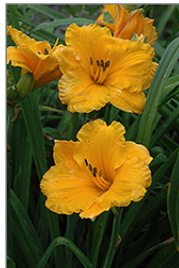
Chicago Sunrise Daylily flowers

Chicago Sunrise Daylily will grow to be about 24 inches tall at maturity extending to 3 feet tall with the flowers, with a spread of 24 inches. When grown in masses or used as a bedding plant, individual plants should be spaced approximately 18 inches apart. It grows at a medium rate, and under ideal conditions can be expected to live for approximately 10 years. As an evergreen perennial, this plant will typically keep its form and foliage year-round.