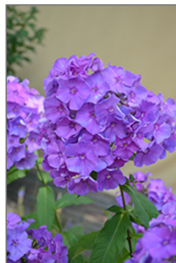
Blue Paradise Garden Phlox flowers

Blue Paradise Garden Phlox is recommended for the following landscape applications;