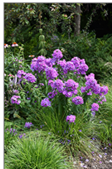
Blue Paradise Garden Phlox in bloom