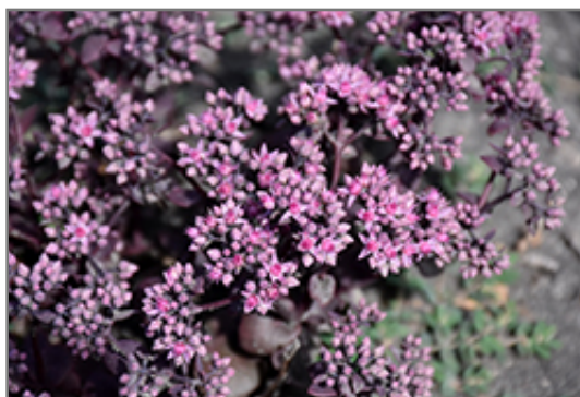
Red Carpet Stonecrop flowers