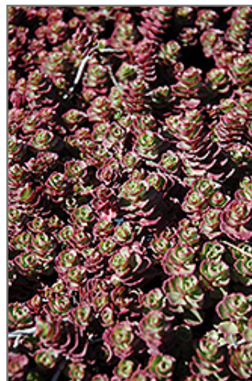
Red Carpet Stonecrop foliage

This plant will require occasional maintenance and upkeep, and is best cleaned up in early spring before it resumes active growth for the season. Deer don't particularly care for this plant and will usually leave it alone in favor of tastier treats. Gardeners should be aware of the following characteristic(s) that may warrant special consideration;