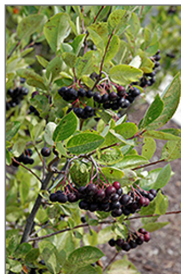
Iroquois Beauty Black Chokeberry fruit