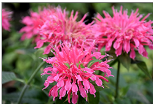
Coral Reef Beebalm flowers

Coral Reef Beebalm is recommended for the following landscape applications;