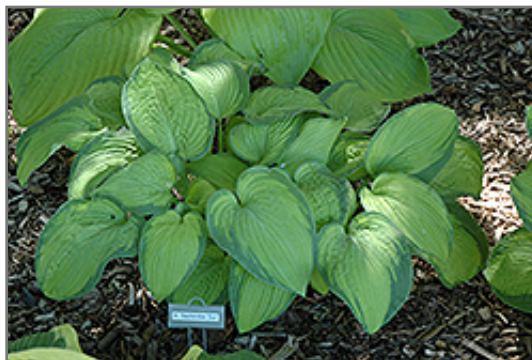
September Sun Hosta