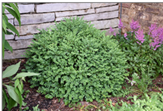
Chicagoland Green Boxwood