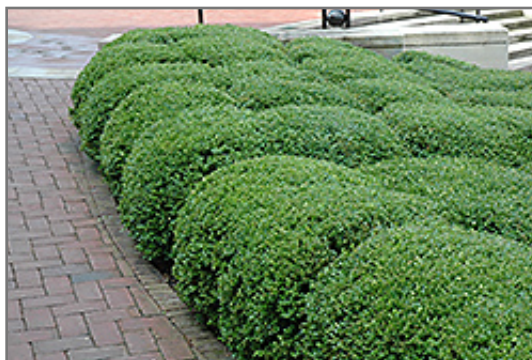
Chicagoland Green Boxwood