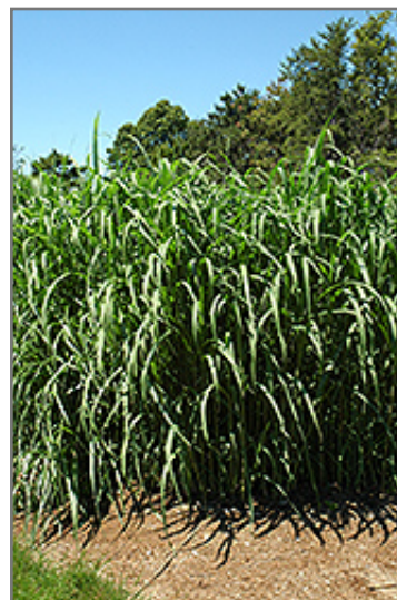
Giant Silver Grass

Giant Silver Grass will grow to be about 7 feet tall at maturity, with a spread of 4 feet. It tends to be leggy, with a typical clearance of 1 foot from the ground, and should be underplanted with lower-growing perennials. It grows at a medium rate, and under ideal conditions can be expected to live for approximately 20 years. As an herbaceous perennial, this plant will usually die back to the crown each winter, and will regrow from the base each spring. Be careful not to disturb the crown in late winter when it may not be readily seen!