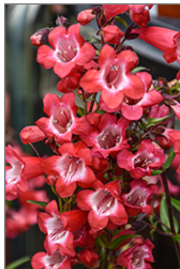
Cherry Sparks Beard Tongue flowers

Cherry Sparks Beard Tongue is recommended for the following landscape applications;