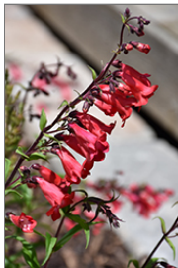
Cherry Sparks Beard Tongue flowers