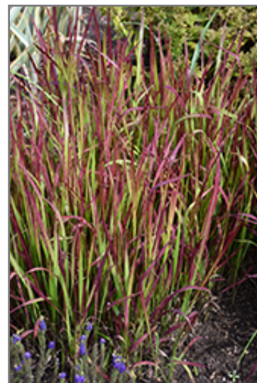
Red Baron Japanese Blood Grass foliage

Red Baron Japanese Blood Grass is recommended for the following landscape applications;