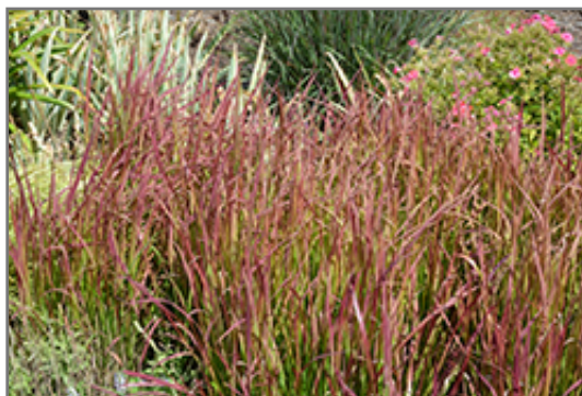
Red Baron Japanese Blood Grass

Red Baron Japanese Blood Grass will grow to be about 20 inches tall at maturity, with a spread of 18 inches. It grows at a slow rate, and under ideal conditions can be expected to live for approximately 20 years. As an herbaceous perennial, this plant will usually die back to the crown each winter, and will regrow from the base each spring. Be careful not to disturb the crown in late winter when it may not be readily seen!