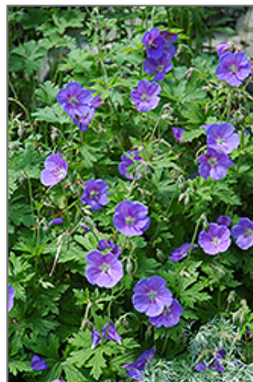
Johnson's Blue Cranesbill flowers

Johnson's Blue Cranesbill is recommended for the following landscape applications;