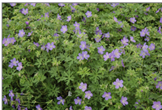
Johnson's Blue Cranesbill in bloom