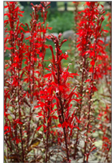
Black Truffle Cardinal Flower flowers