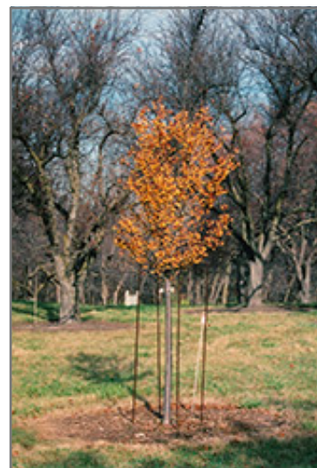
Lancelot Flowering Crab fruit