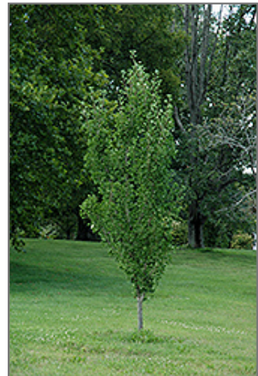
Presidential Gold Ginkgo