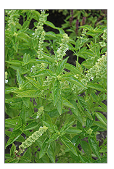
Sweet Italian Basil flowers

520 Highway 1 West Iowa City, Iowa 52246 (319) 337–8351 www.iowacitylandscaping.com