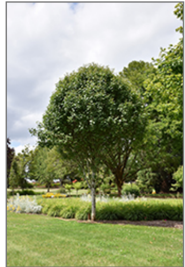
Jack Ornamental Pear

This tree should only be grown in full sunlight. It prefers to grow in average to moist conditions, and shouldn't be allowed to dry out. It is not particular as to soil type or pH. It is highly tolerant of urban pollution and will even thrive in inner city environments. This is a selected variety of a species not originally from North America.