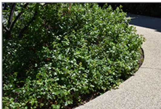
Gro-Low Fragrant Sumac

Gro-Low Fragrant Sumac is recommended for the following landscape applications;