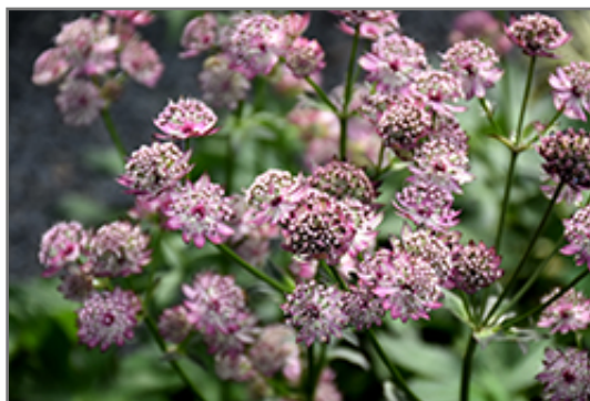
Abbey Road Masterwort flowers