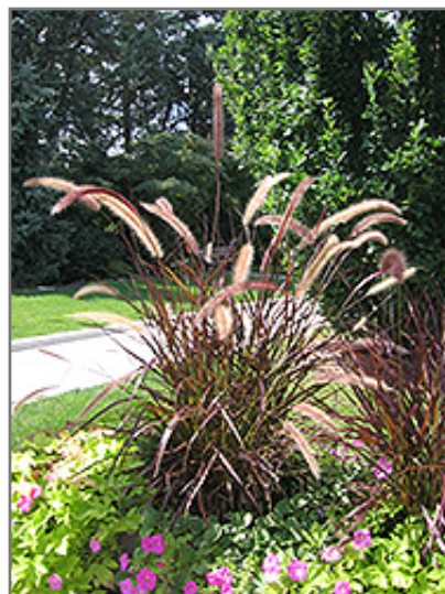
Purple Fountain Grass flowers

Purple Fountain Grass is recommended for the following landscape applications;