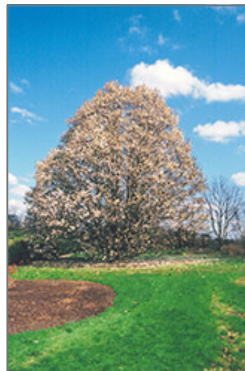
Wada's Memory Magnolia in bloom

Wada's Memory Magnolia will grow to be about 30 feet tall at maturity, with a spread of 20 feet. It has a low canopy with a typical clearance of 5 feet from the ground, and should not be planted underneath power lines. It grows at a fast rate, and under ideal conditions can be expected to live for 80 years or more.