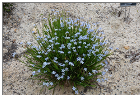
Narrowleaf Blue-Eyed Grass in bloom