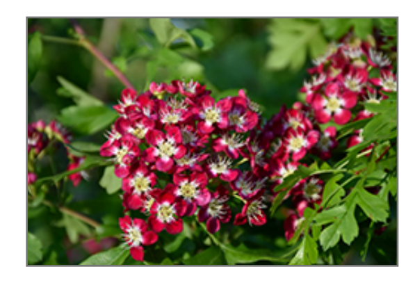
Crimson Cloud English Hawthorn flowers