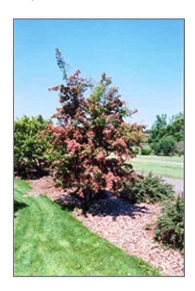
Crimson Cloud English Hawthorn in bloom