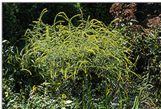
Fireworks Goldenrod in bloom