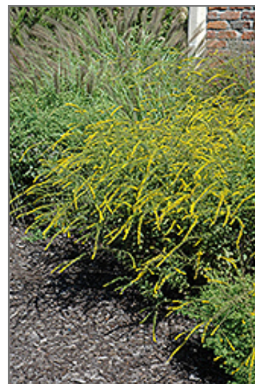
Fireworks Goldenrod flowers